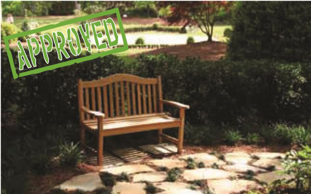
Figure A Configurations RECOMMENDED